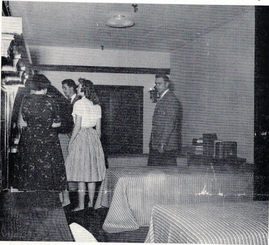
A WELL-FURNISHED DEL MAR BEDROOM

This property is indeed a valuable addition to our much-blessed campus.