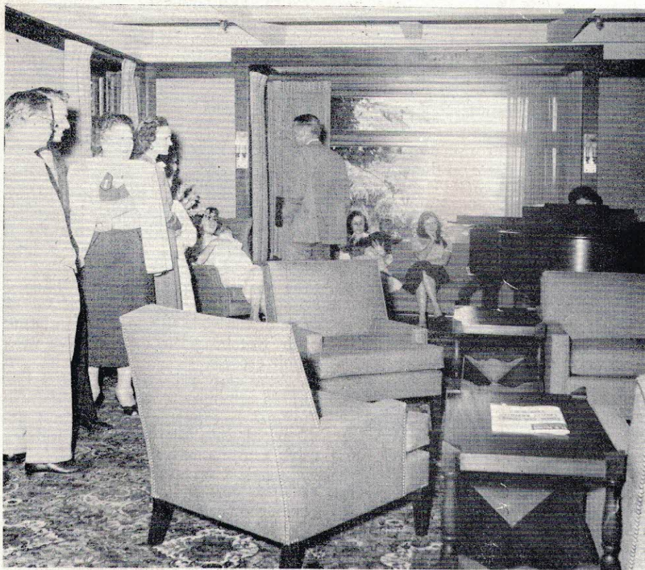
EXQUISITE DEL MAR LOUNGE ROOM